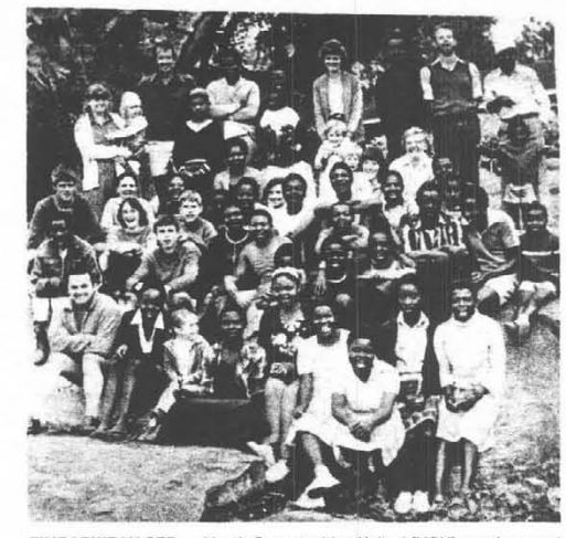
ZIMBABWEAN SEP — Youth Opportunities United (YOU) members and staff pose for a photograph Aug. 22 during the Summer Educational Camp at Lake Lesapi.