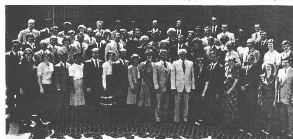
REFRESHING PROGRAM — Ministers and wives participating in the 10th session of the Ministerial Refreshing Program Aug. 30 to Sept. 9 gather for a photo at the Loma D. Armstrong Academic Center on the Pasadena Ambassador College campus Sept. 2. Ministers and wives attended from Northern Ireland, Australia, New Zealand, Canada, the Philippines, Trinidad, South Africa and the United States, [Photo by G.A. Belluche]