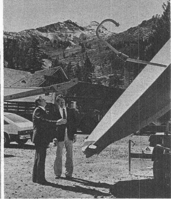
LAKE OF THE OZARKS, MO.