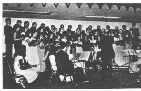
SPECIAL MUSIC - The Pasadena Church Choir and Chamber Ensemble perform at the Tijuana and Mexicali, Mexico, combined Sabbath services Aug. 21 in Tijuana. (See "Church Activities," page 7.)