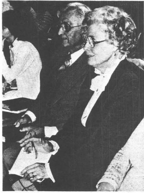
THOSE WHO HAVE EARS - Brethren listen during Feast of Tabernacles services in Mount Pocono, Pa.