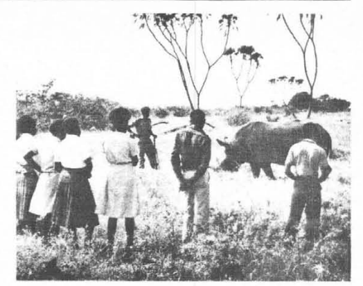
GAME VIEWING — Young people of the Kibirichia, Kenya, church observe a rhino during an outing to the Meru National Park Aug. 15 and 16. (See "Youth Activities," page 12.)

The LETHBRIDGE, Alta., church conducted its first orienteering outing