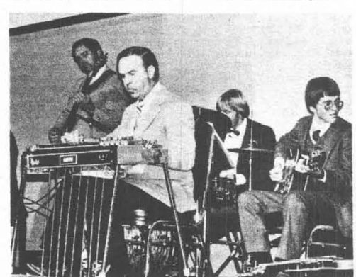
FEAST PICKIN' — Brethren try their hands at pickin' and playing during a social at the Festival in Spokane, Wash.

The deaf at Squaw Valley weren't (See 1982 FEAST, page 5)